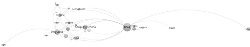
Figure 3. The most productive countries

Figure 3 shows the most productive countries in terms of the number of publications included in the study. The authors of the papers studied come from 56 countries. The most productive country is the United States of America (USA) with 32 published papers, followed by England with 14 published papers and the Republic of China with 11 published papers. Other countries that are the subject of this study have less than 10 publications.